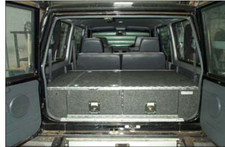
BW1000 Twin drawers fitted to GQ

Note: If vehicle fitted with full length barrier, BW900 drawers can be fitted.